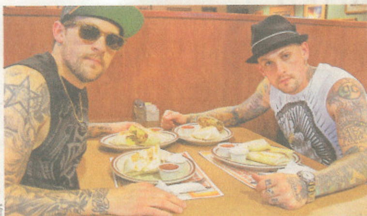
Good Charlotte band members Joel (left) and Benji Madden with the Denny's burritos they created.